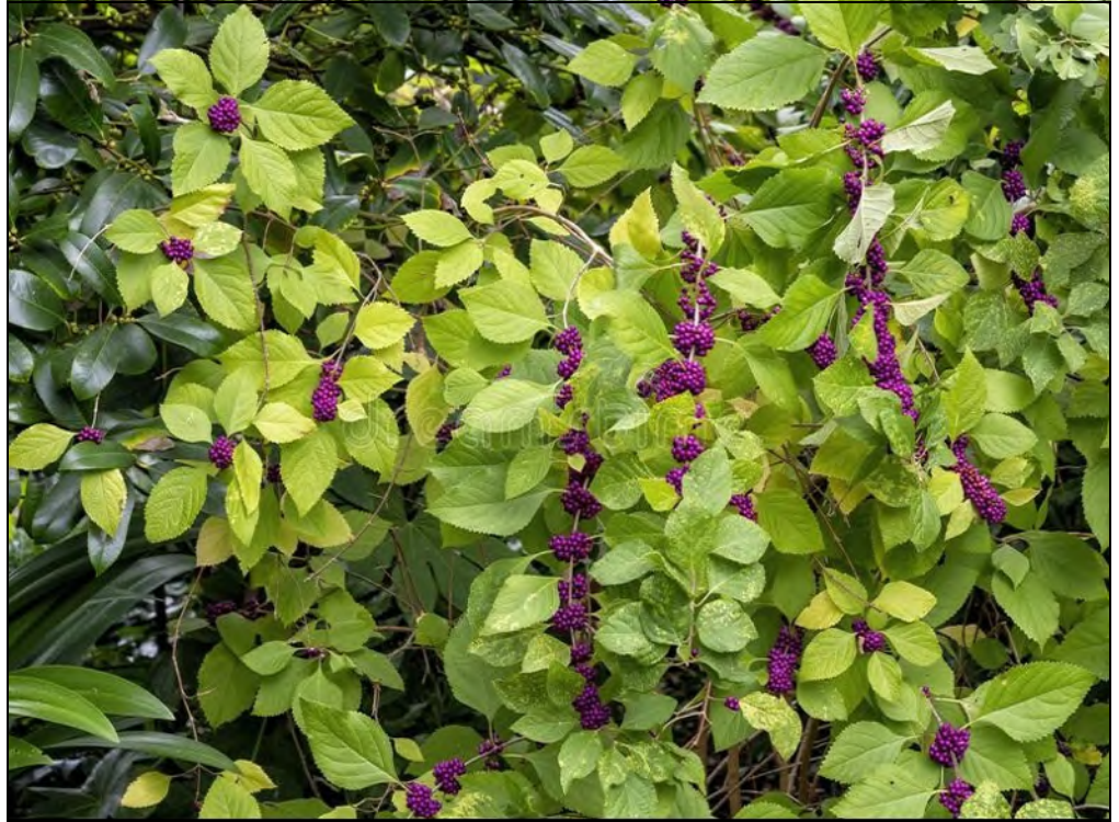
The long branches of the beautyberry have an arching habit

Humans can use American beautyberry too. The berries can be