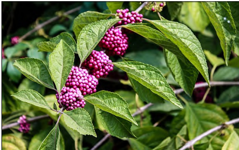
Berries provide food for birds and other critters

Beautyberry is native from Virginia to Arkansas and Florida to Texas. It is a heat-tolerant, cold-tolerant, drought-tolerant, beautiful shrub that brings a variety of birds, pollinators and critters to any backyard habitat.