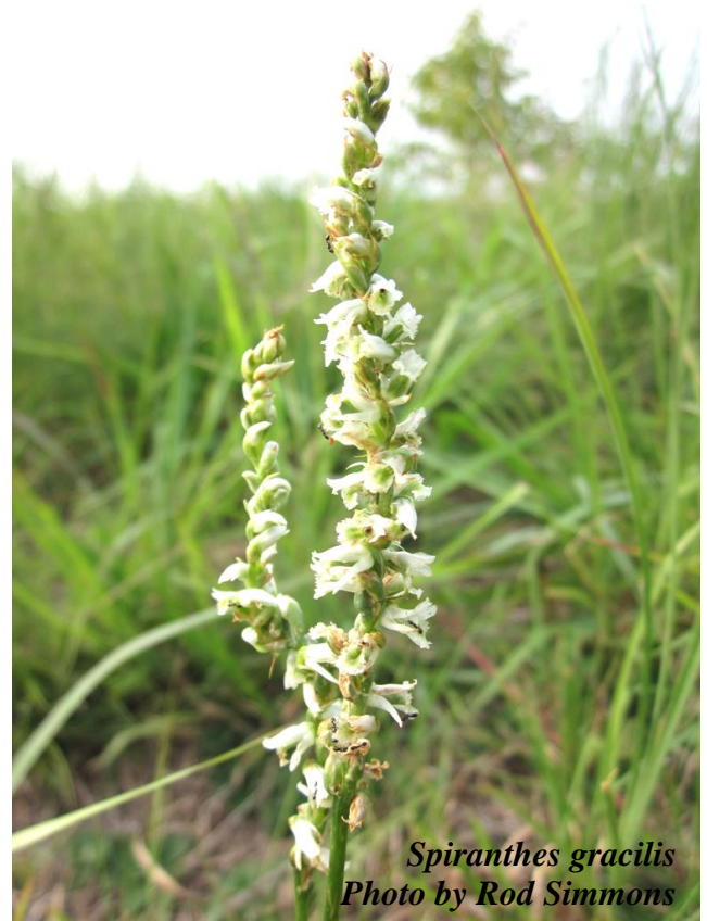
Spiranthes gracilis

Slender Ladies-tresses Orchid is fairly small and very thin and blends in with graminoids, but has conspicuous white flowers. It seems not to occur on strongly acidic soils, but prefers largely undisturbed, dryish open grassy areas, often rocky or gravelly, with a diversity of native grasses (especially Dichanthelium spp.) and sedges ( Carex spp.). It is well distributed throughout its range, but is uncommon to rare in our region.