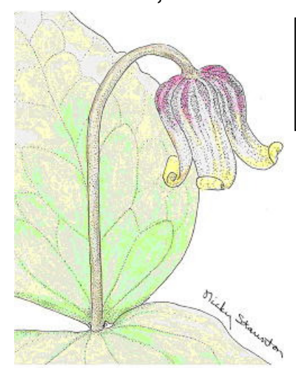
Curlyheads (Clematis ochroleuca)