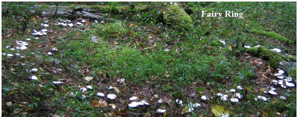
PIEDMONT CHAPTER VIRGINIA NATIVE PLANT SOCIETY P.O. BOX 336 THE PLAINS, VA 20198