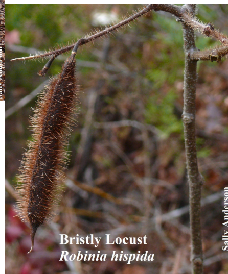
Bristly Locust Robinia hispida

So late in the year, nearly all the plants were past their flowering stage, showing the many diverse ways they have of presenting and dispersing their seeds.