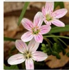
Spring Beauty (Claytonia virginica) by M.Lobstein

Our Spring Wildflowers and Their Western U.S. Relatives