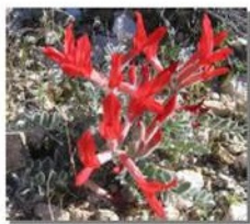
Scarlet Loco

Adventures in Plant Identification: Tools, Tips, and Tricks for identifying plants when you are away from home