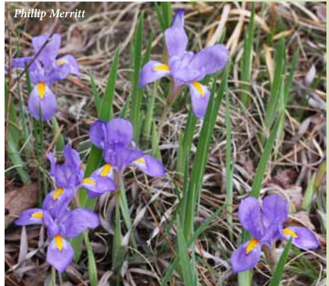
Dwarf Vernal Iris

Another introduced member of this family is Blackberry-lily ( Iris domestica ), which doesn't look anything like a typical iris. There are six flat orange petal-like parts, mottled with purple. The fruit capsule opens to expose a mass of round, shiny, black seeds, which together resemble a blackberry. Now placed in the Iris genus, the plant has been known as Belamcanda chinensis , and is sold for use in flower gardens. The name suggests its origin in China and Japan; the seeds can be toxic if eaten.