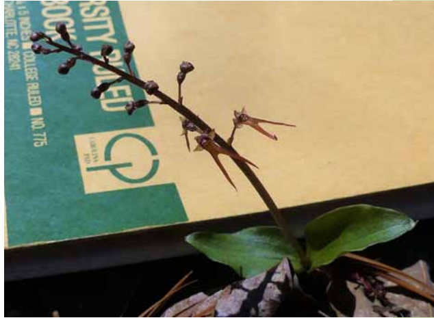
Keith Navia's photo of a blooming Southern Twayblade (minus the background distraction of leaf litter)

The last order of the day was to share the location of a known colony of Pink Lady's-Slipper. They had not leafed out yet, but we found one stalk with an empty seed pod still standing after the winter's abuse and sporting the first hint of a green bud just above ground. That stalk anchored the colony location, and we made notes aloud of visual clues to help walkers to return to the right spot in about a month for another blooming treat.