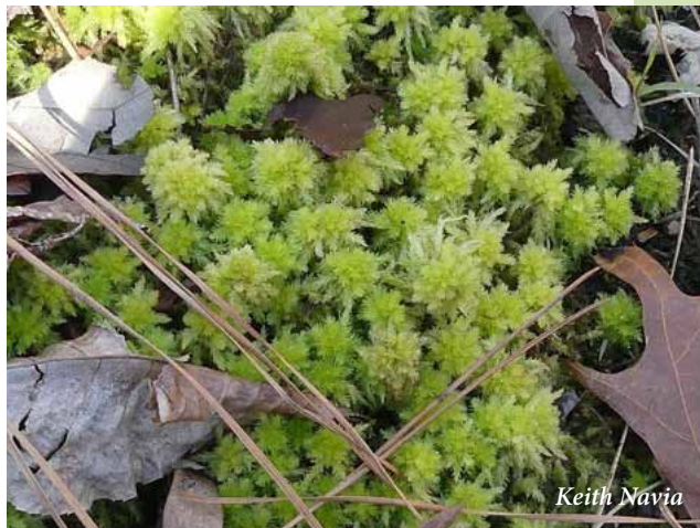
Sphagnum Moss growing along the trail