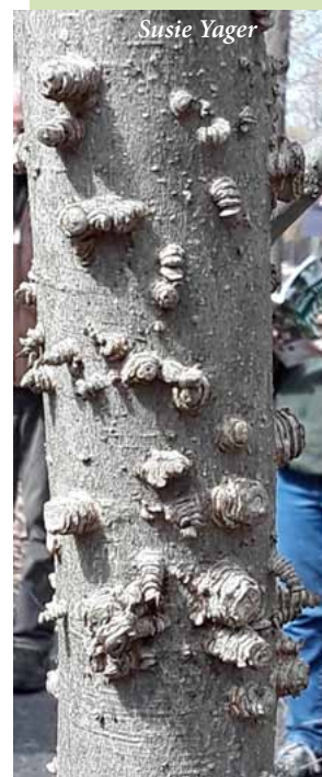
The Hackberry's warty trunk