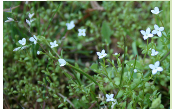
Donna's Southern Bluets