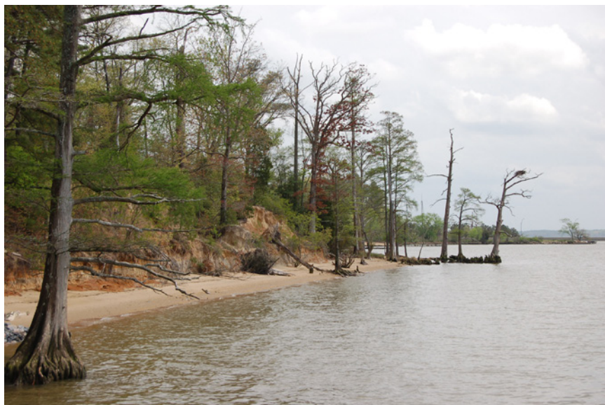
A "before" photo of the site on the James where CBF restored a shoreline

Campaign Organizer, rallying citizen support for clean water legislation pending in the U.S. Congress. She also is a graduate of CBF's Volunteers as Chesapeake Stewards program and, as a volunteer, headed a successful effort to fund and implement a living shoreline project that now protects 400 feet of James River shoreline in James City County, VA. Since joining CBF full time, she has completed many restoration projects, including designing and implementing buffers, vegetated swales, and rain gardens.