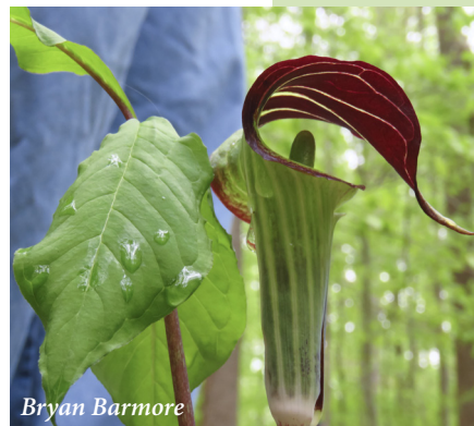
Jack in the pulpit