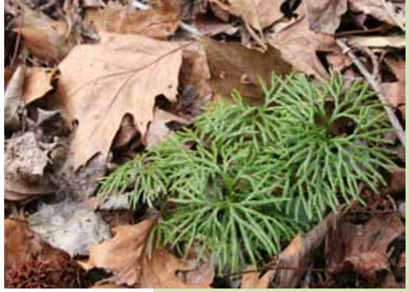
Southern Ground Cedar (Diphasiastrum digitatum)

11:00 am when we returned to our cars, the colonies of Ground Cedar and Princess Pine had thawed out and really put on a show in the forest as their green leaves unfurled. Mary Turnbull