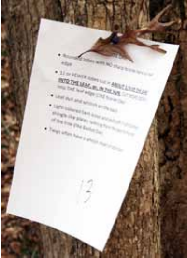
One of the labeled trees on the trail. This one is a white oak.