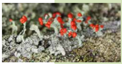
A troop of British Soldier Lichen (Cladonia cristatella)