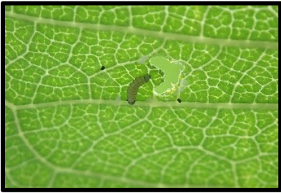
Figure 2: Monarch caterpillar, newly hatched 8/17/18

through September. The adults emerging from their chrysalis in late September/early October are those that will join the fall migration. These individuals will be the adults migrating to Mexico and the adults that will be the first to reproduce next spring upon their return to Texas.