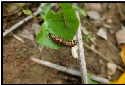
Figure 8: Variegated fritillary caterpillar

The best way to ensure that fritillaries visit your garden is to plant violets. Violets do have their drawbacks; they interrupt the uniformity of a well-tended lawn, and they also spread easily since seeds of some violet species are ejected explosively, and violet seeds are readily dispersed by ants. (Each seed has an elaiosome, a nutritionally rich, oily outgrowth that ants relish and carry back to their nests with the seed still attached.