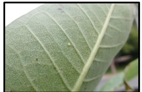
Figure 1: Monarch egg, deposited 8/18/18

We are seeing a lot of monarch butterflies now because they are moving through Virginia, laying eggs in their last reproductive cycle for 2018. The resulting caterpillars will feed on milkweed ( Asclepias spp. )