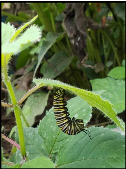
Figure 4: Monarch caterpillar starting to change in to chrysalis

For more information on monarch populations and migration tracking visit Monarch Watch monarchwatch.org and Journey North at https://journeynorth.org/monarchs .