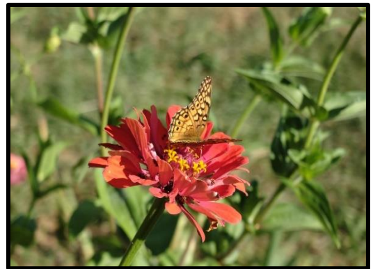
Figure 6: Variegated fritillary on zinnia

The variegated fritillary butterfly is somewhat smaller and less vividly colored. However, its caterpillar is much showier than the mostly black caterpillar of the great spangled fritillary. The variegated fritillary caterpillar has red stripes separated by black lines with white splotches. This vivid coloration may be a way for the caterpillar to signal predators that it would be a foul-tasting mouthful. Otherwise, it would be hard to understand how it manages to escape predators since it is certainly easy to spot on violet or passionflower leaves, its main host plants. But the truly spectacular phase of the variegated fritillary's metamorphosis is its chrysalis, which is creamy white with black and gold markings and conical gold buttons. It must be one of the most beautiful chrysalises of any butterfly.