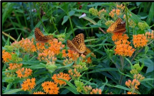
Figure 7: Great spangled fritillaries on butterfly weed

Some of the most common butterflies in our area are the fritillaries, especially the great spangled fritillary and the variegated fritillary. They are the most abundant butterflies in my garden, probably because violets are their major host plant and I have lots of violets, both in the grass and acting as living mulch in my flower garden.