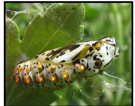
Figure 9: Variegated fritillary chrysalis

Once the elaiosome is consumed, the seed is discarded, allowing it to sprout in a new place.) But on the plus side, violet flowers are lovely and, if you want to attract fritillaries, including some violets in your planting scheme is the best way to do it.