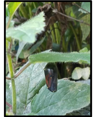
Figure 3: Chrysalis hours prior to emergence

We have such a sense of stewardship over the tiny caterpillars as they emerge: checking them, counting to make sure everyone is there, getting nervous when the milkweed seems like it might not be enough, and waiting for them to become the adults who will make the long journey south. It feels almost magical when the monarch mommas return in August and that by planting just a couple of common milkweeds, we are somehow a small part of something much greater than ourselves. Last fall, there was one adult who emerged after pupation, its chrysalis attached to a Monarda didyma in our garden not far from where it grew up feasting upon milkweed. We watched it emerge, pump its wings, and fly away circling over our home many times before joining the migration. I like to think it was in some small way saying, “thanks”.