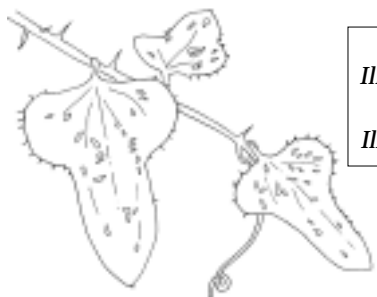
Greenbrier (left) Dogwood (right)