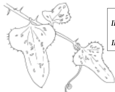
Greenbrier (left) Dogwood (right)