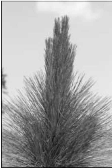
Pinus Palustris, longleaf pine

In early June, a group of John Clayton Chapter members gathered in Sussex County for a tour of the Joseph Pines Preserve. Hundreds of years ago, a climax longleaf pine forest probably stood here. This unique and incredibly diverse ecosystem, once dominant in the southeastern United States, historically reached its northern limit here in southeast Virginia. But the most evident indication of a formerly grand ecosystem at the preserve are the remains