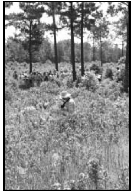
John Clayton members explore the Joseph Pines Preserve while on a field trip.

Unfortunately, the pitcher plant and many other species have been eradicated from their native territory. Indeed only two wild populations of the endangered yellow pitcher plant still exist in Virginia, and