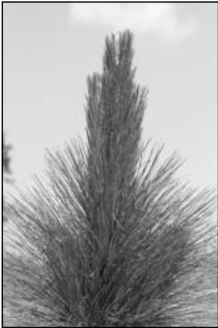
Pinus Palustris, longleaf pine

In early June, a group of John Clayton Chapter members gathered in Sussex County for a tour of the Joseph Pines Preserve. Hundreds of years ago, a climax longleaf pine forest probably stood here. This unique and incredibly diverse ecosystem, once dominant in the southeastern United States, historically reached its northern limit here in southeast Virginia. But the most evident indication of a formerly grand ecosystem at the preserve are the remains