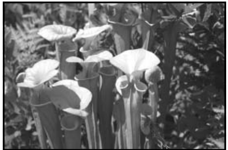
Sarracenia flava, yellow pitcher plant