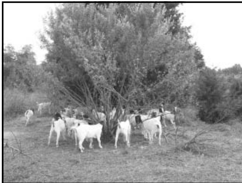
A herd of goats teams up on an autumn olive.

in a field, goats don't like to get their feet wet, so if there is a stream within an area being cleared, they will not degrade the stream banks by stepping down into the water. They will never stand in the stream and defecate.